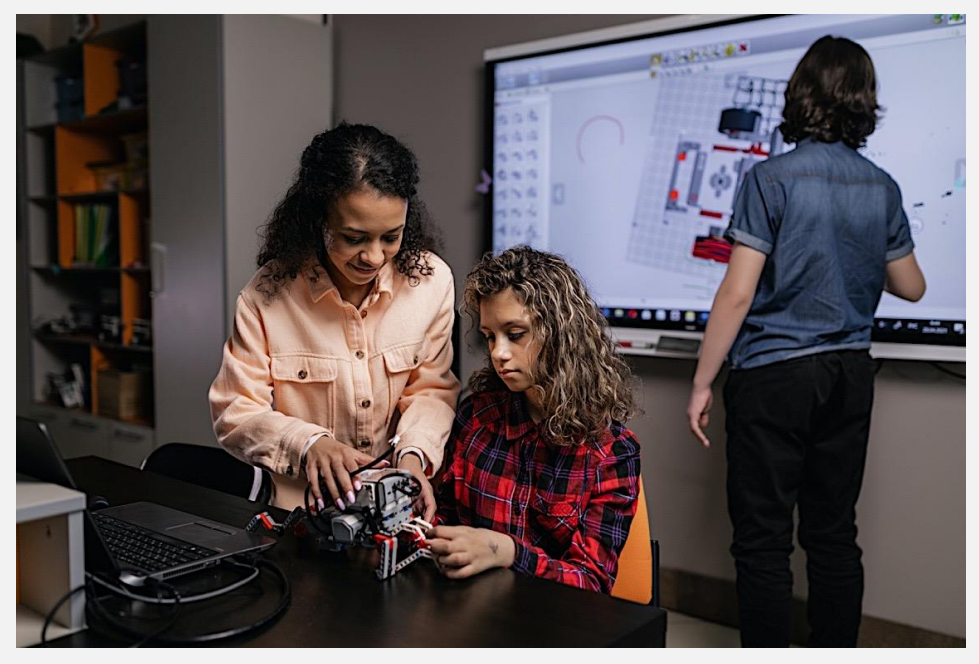
April 2024, Volume - I, #ISSUE- 0003

Sci-FLUX: Fueling Minds, Illuminating Paths.